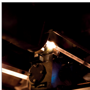
P-VIP® bulb forming

OSRAM uses a global network of distributors to supply its P-VIP® projection lamps to a wider network of traders. These stockists can then provide OSRAM's comprehensive P-VIP® range onto the aftermarket. The OSRAM P-VIP® range includes lamps for both commercial projectors and rear-projection TV. End users interested in P-VIP® lamps, or P-VIP technology, can either contact OSRAM directly or our distributors to receive details of P-VIP® stockists in their region. List of distributors: http://www.osram.com/distributorsearch-do